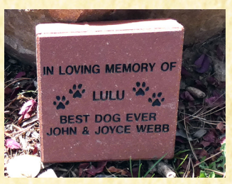
Engraved memorial bricks

The cost of cremations and pet memorials helps fund our animal shelter, giving you an opportunity to help other animals in need while saying farewell to your true friend and celebrating the life of your pet in a way that is meaningful. Each pet is treated with professionalism, care and compassion and we have multiple cremation and memorial options available. If you have questions or would like additional information about pet cremations, please contact our animal shelter at 970-731-4771.