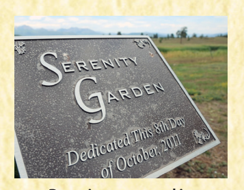
Remains scattered in our Serenity Garden