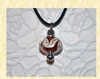
Glass bead infused with ashes