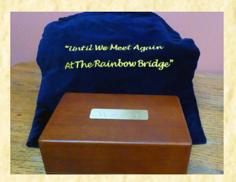
Hand-crafted wooden urn with engraved pet name